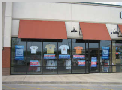
Store Front of the Learning Center's Derby Gift Shop in 2008

This year the Learning Center's Derby gift shop will take yet another form. While licensing agreements still prevent us from selling on the backside on Oaks and Derby Days, the week leading up to Derby weekend we can take full advantage of our backside location.