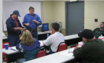
Groom Elite 101 in Spring 2008 at Churchill