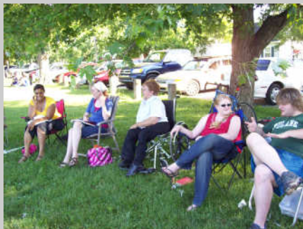
The volunteers hanging out on the sidelines while the guys play soccer.

fun. Most of the time the Soccer teams are all men but occasionally we have a woman, usually an American. It's very