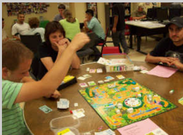
Students and Volunteers playing Life during Bilingual Game Hour

we even forgot about the Jumbling Tower! Uno and Brain Warp were two