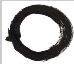
The enso is an emblem of Zen Buddhism.

with any new job there are growing pains and there's one key area where my evolution as an employee has been slower. Only an inherent special wisdom