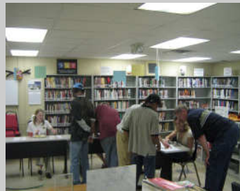
Spring Open House

Center given by staff, register for classes at tables overseen by volunteers, and finally enter our classroom extension where they could pick up their complimentary pizza.