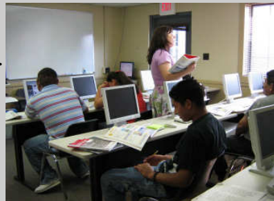
Intermediate English Class

Another exciting addition to our programming is the Bilingual Hour. This is a form of conversation practice that will take place on Thursday evenings in a relaxed environment. A student and volunteer will pair up and practice con-