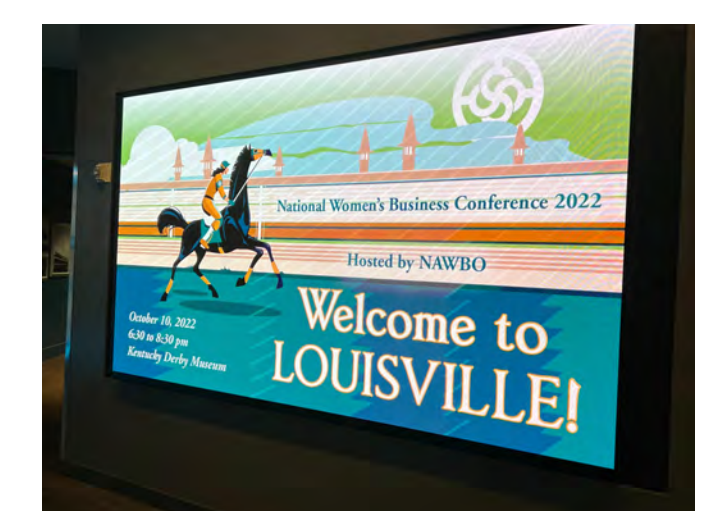
Video Wall (Custom photo or logo) - $150