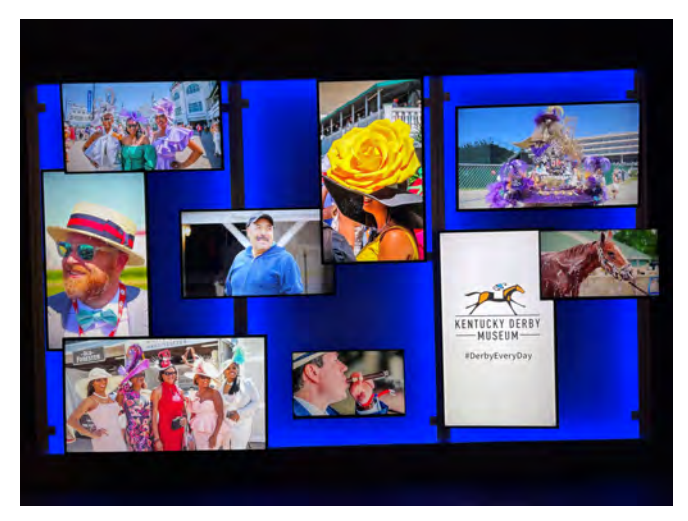
Mosaic Wall - $250