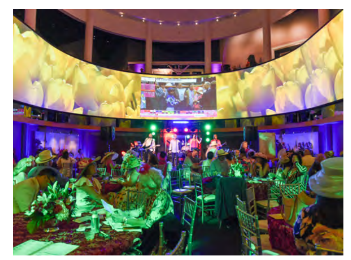
360° Screen Customization (PowerPoint capability) - $500