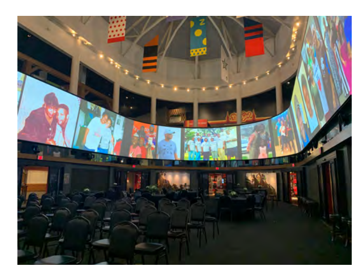
360° Screen Wrap (18 photos or logos) - $750