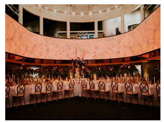
360° Screen Still Image (roses, tulips, bourbon or Churchill Downs) - $250