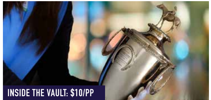
INSIDE THE VAULT: $10/PP

What's your fashion attitude? Big brim with lots of trimmings or simple and chic? During Hatitude, you will create your very own Kentucky Derby hat. We provide the hat, all the ribbons, bows, flowers and fanfare - you provide the style.