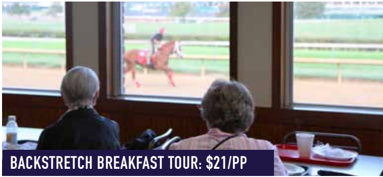
BACKSTRETCH BREAKFAST TOUR: $21/PP

VIP Experiences also require purchase of Museum General Admission. Please allow an additional 45-60 minutes for each VIP added to your groups General Admission Experience.