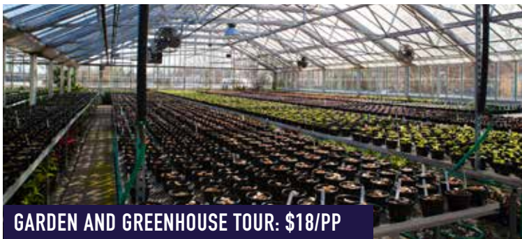
GARDEN AND GREENHOUSE TOUR: $18/PP

With $5,000 worth of "Horsey Bucks," everyone is a high roller! This mock racing event allows guests to share in the fun & excitement of wagering and learn about handicapping the horses. Remember, there's a winner in every race!