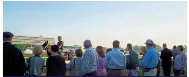
DERBY SEASON BACKSTRETCH BREAKFAST TOUR: $35/PP

Experience the authenticity of the private backside of the race track during a rail side breakfast in the Track Kitchen while watching the horses during their morning workouts. This area is not available to the general public. Offered March - December.