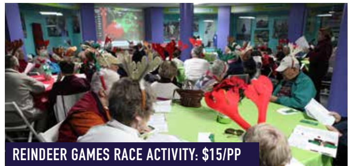
REINDEER GAMES RACE ACTIVITY: $15/PP